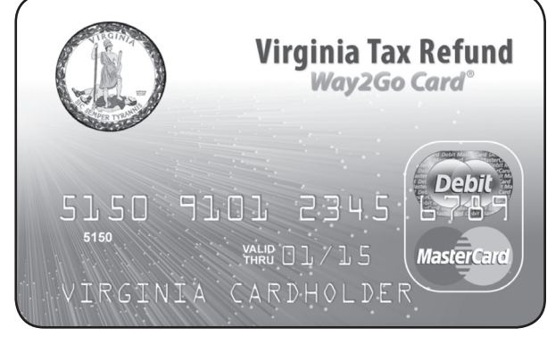
The Virginia Debit MasterCard is issued by Comerica Bank pursuant to a license from MasterCard International Incorporated.

24 hours a day / 7 days a week or visit the website at: <u>www.GoProgram.com</u>